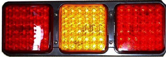
3 Panel LED

Official Distributor of Predator Equipment