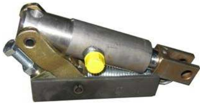
Agri Axle Brake Ram Assembly