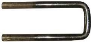
Agri Axle Suspension U Bolt 80 & 90mm