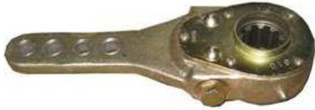
Manual Slack Adjuster

Official Distributor of Predator Equipment