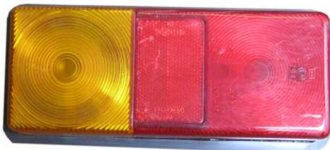
Rubber Backed Light Cluster