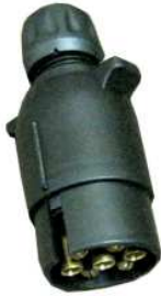
7 Pin Plug

Official Distributor of Predator Equipment