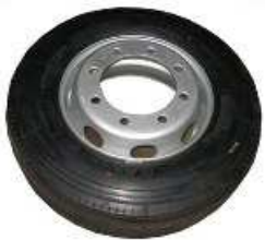
215/75/17.5 & 235/75/17.5 8 stud full wheel assembly.