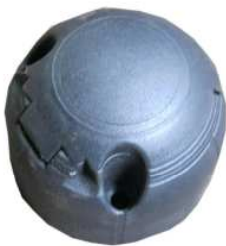
7 Pin Socket