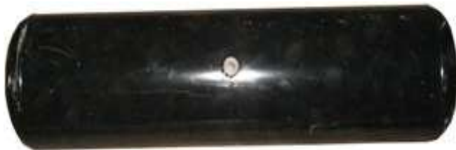
Air tank used for air brakes on Fast-Tow Trailers