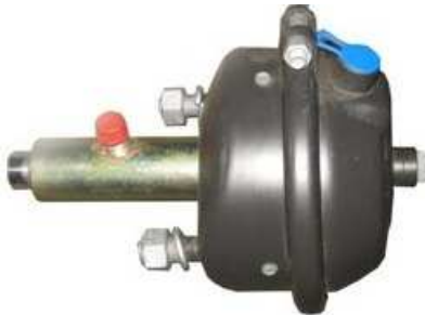
Air over Hydraulic brake chamber used on Fast-Tow trailers